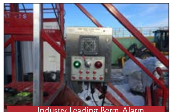
Industry Leading Berm Alarm System with every system