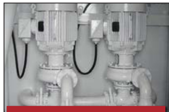
Dual 60 Horsepower electric mix motors