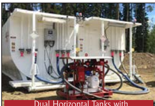
Dual Horizontal Tanks with Remote Pump Manifold