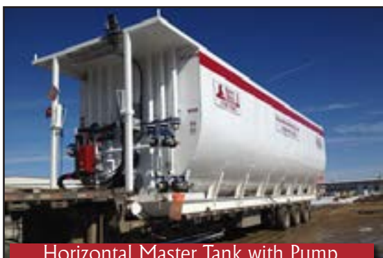
Horizontal Master Tank with Pump Manifold mounted on the porch

Horizontal Tank Rentals Oilfield Surface Equipment Rentals Alberta, British Columbia, Saskatchewan Canada