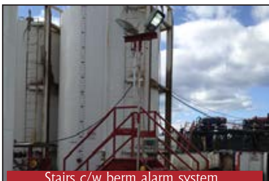
Stairs c/w berm alarm system and LED lighting

Tank Farm Rentals - Oilfield Surface Equipment Rentals Alberta, British Columbia, Saskatchewan Canada