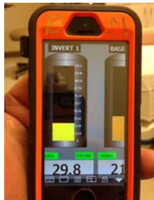
Iphone Tank Level Read Out for Horizontal Tanks

Service available 24/7 365 days a year Full maintenance packages