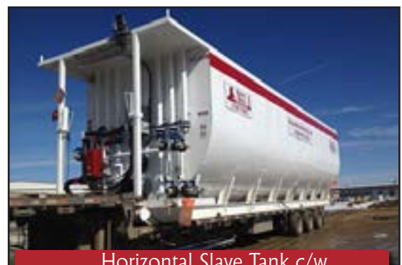
Horizontal Slave Tank c/w Mobile Phone Tank Level Readout