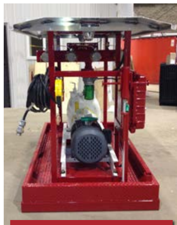
Pump Manifold c/w Pump Run Light

Heavy Horse Exclusive!! Industry Leading Berm Alarm System with every Containment Ring