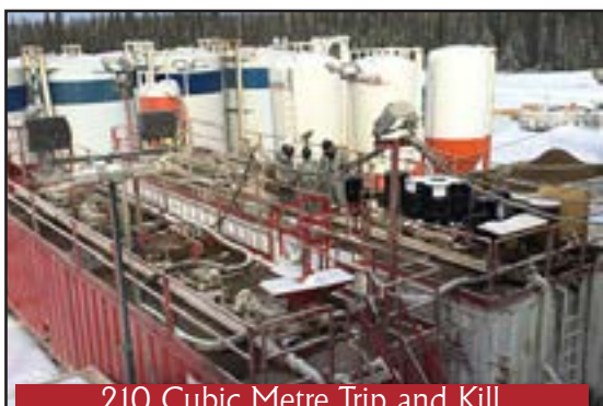
210 Cubic Metre Trip and Kill Mud System

Premix Mud Tank Rentals Oilfield Surface Equipment Rentals Alberta, British Columbia, Saskatchewan Canada