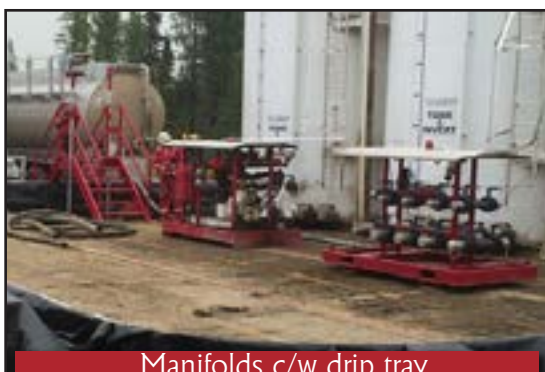
Manifolds c/w drip tray, roof, and LED lighting