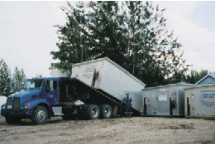
Water Tanks Available • We deliver