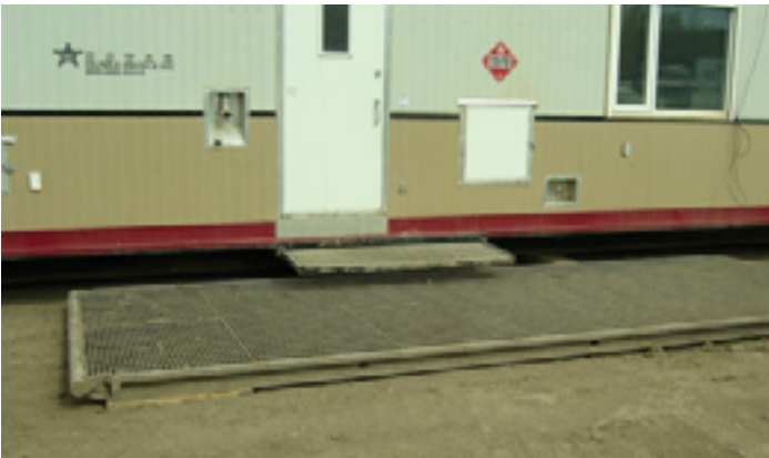
20 Foot Grate Mats • We deliver