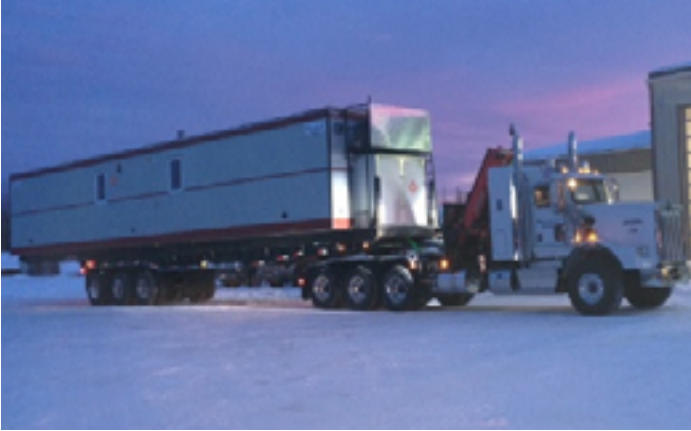
Tractor Texas Bed with Picker Truck.