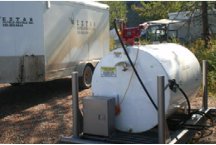
Fuel Skids - 500 & 1000 Gallon Units Available • We deliver