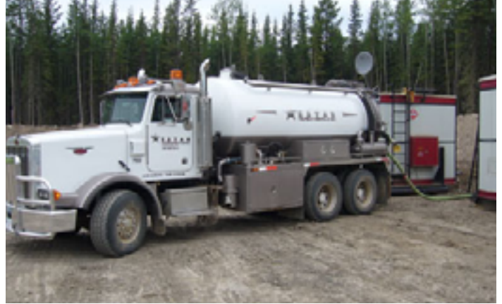
Always documented & disposed of at a BC Health certified site.