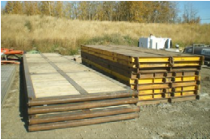
Rig Matting • We deliver